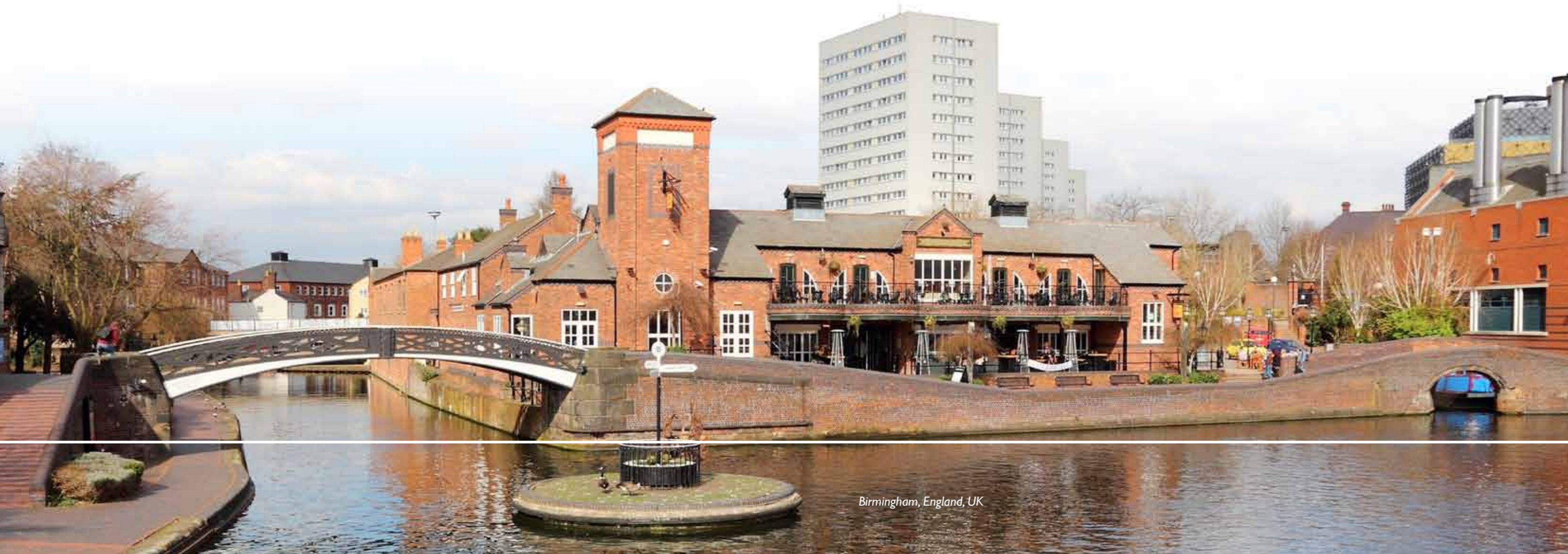
Birmingham, England, UK

“We deliver a comprehensive service throughout the UK via our network of registered Engineers and telephone support staff.”