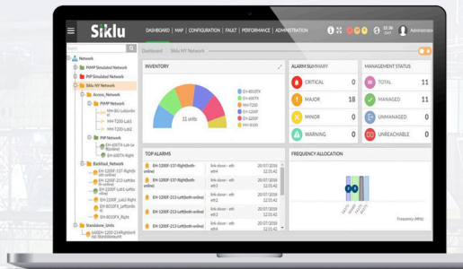
Siklu SmartHaul™ Network Software Tools