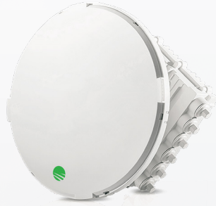
EtherHaul™ Kilo Rooftop