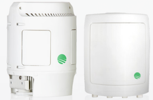
MultiHaul™ TG Mesh

Plug-and-Play Street level up to 1.8Gbps Aggregated