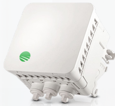
EtherHaul™ Street Level