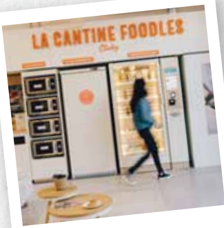
Foodles Canteen, France